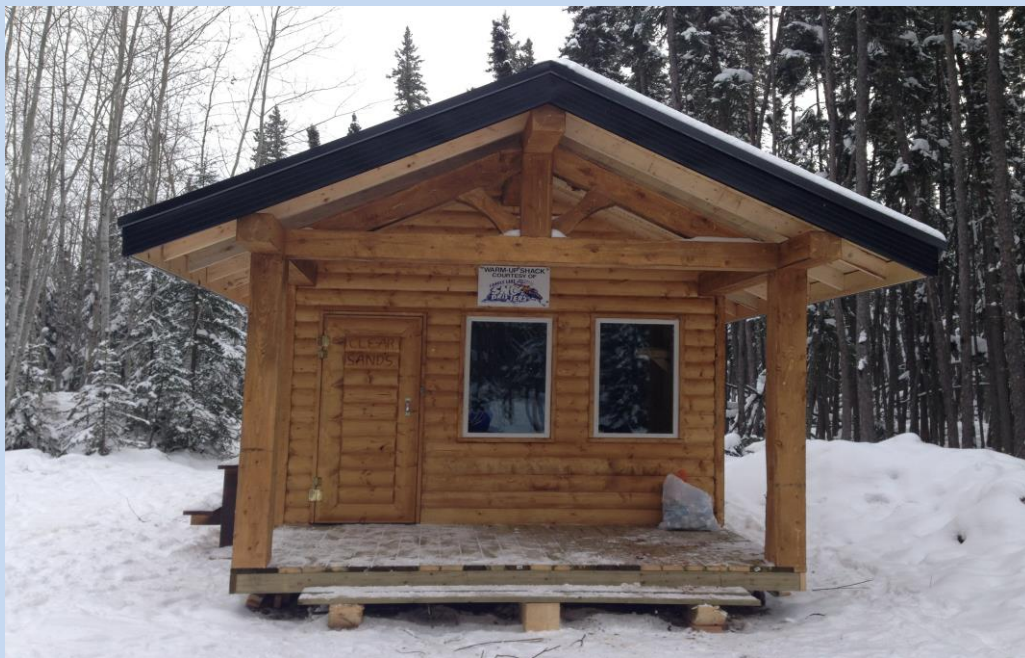
CLEAR SANDS SHELTER