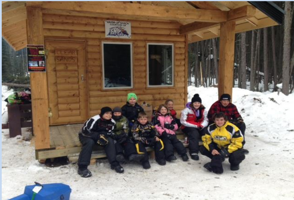
CLEAR SANDS SHELTER