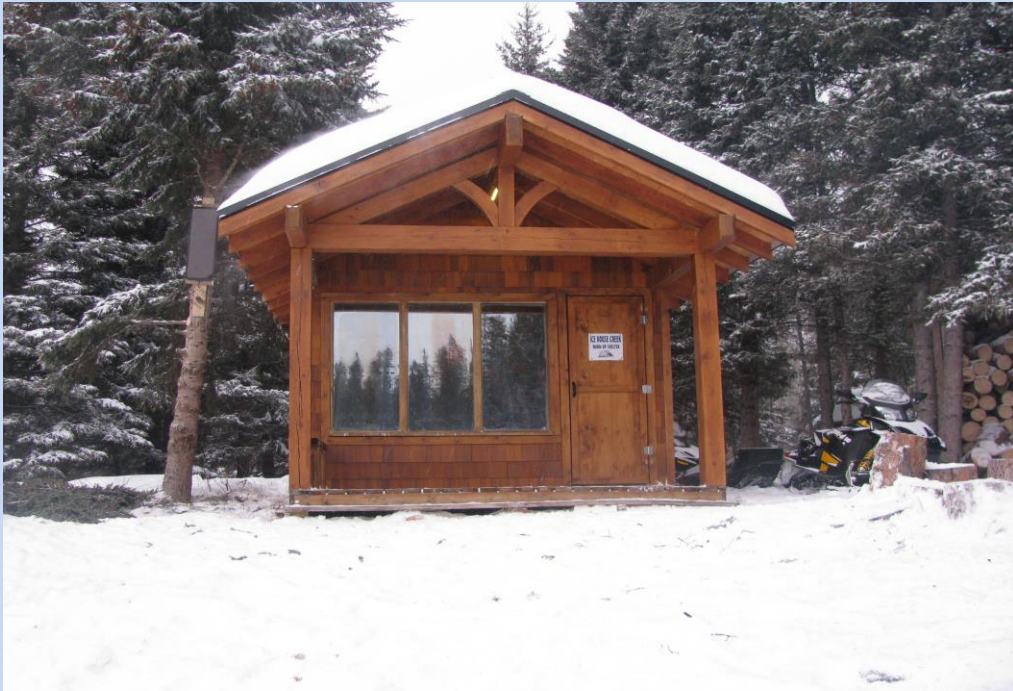
ICE HOUSE CREEK SHELTER