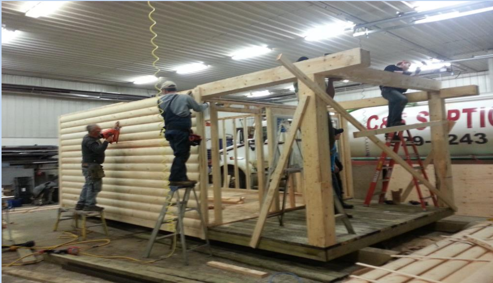
CLEAR SANDS SHELTER