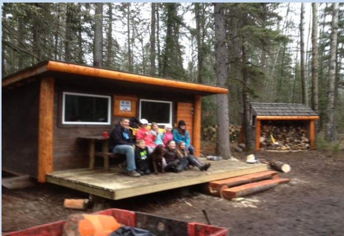
BAY LAKE SHELTER