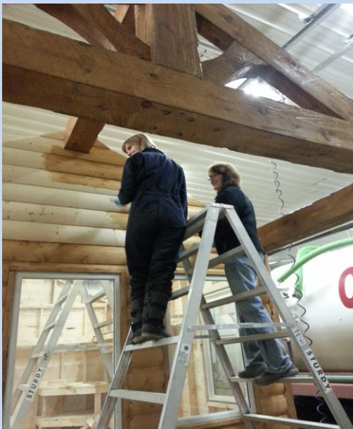
ICE HOUSE CREEK SHELTER