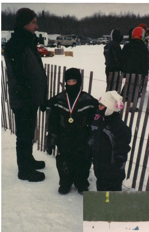
Snow Cross Medal at 4 years old