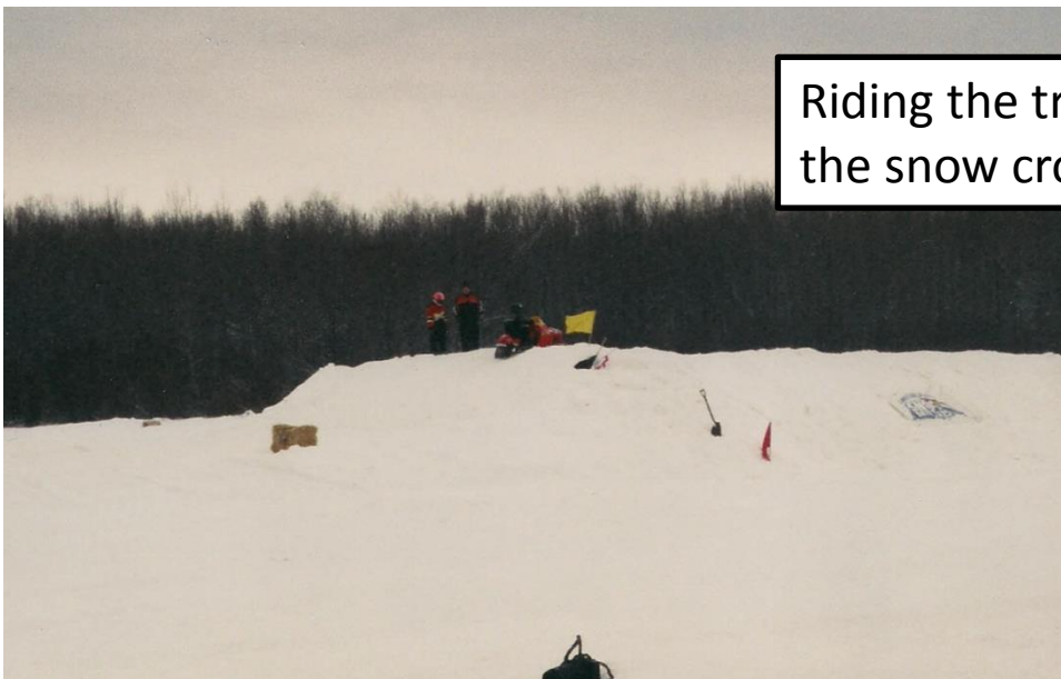
Riding the track at the snow cross race