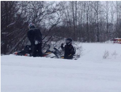
Giving a helping hand to a Rylan who is stuck.