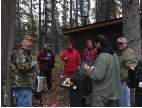
Enjoying Thanksgiving out at the Bay Lake Shelter