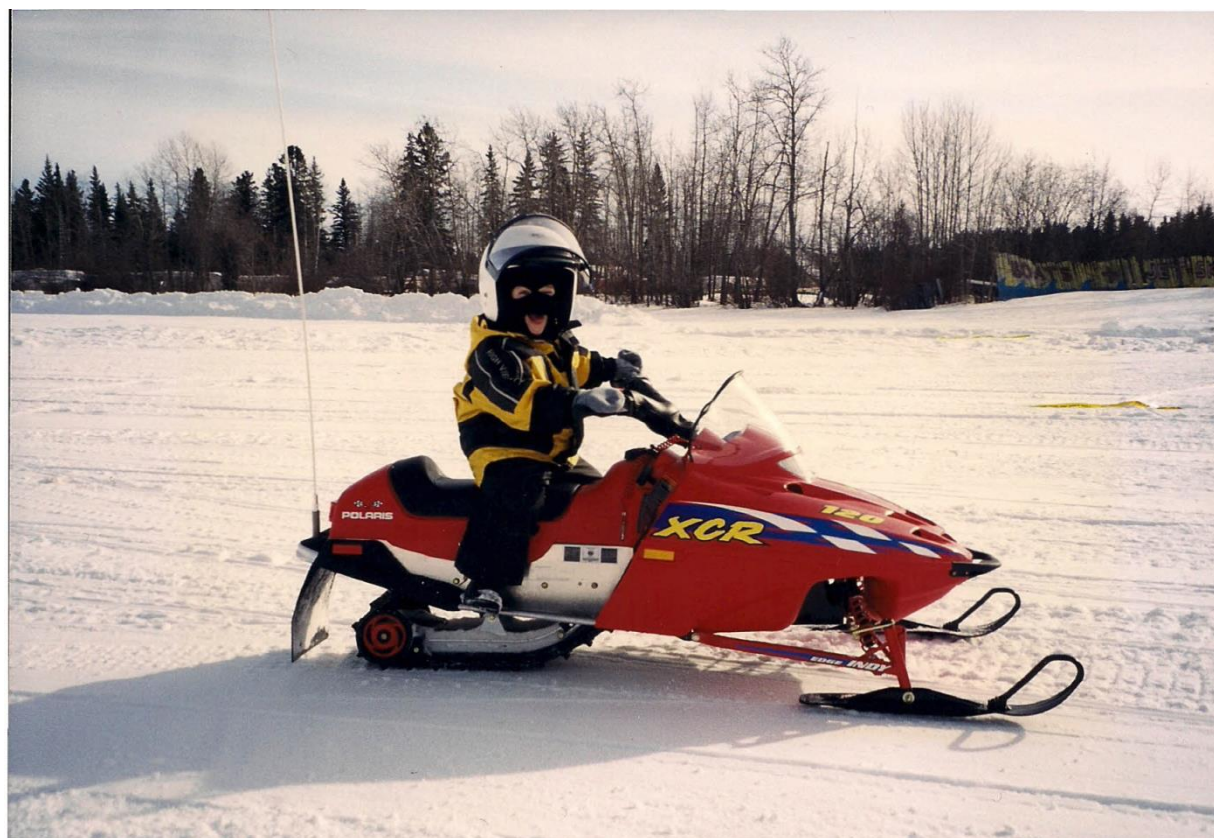
Riding on the lake at 2 ½ years old