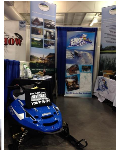
SSA Show booth and picking up signs along the trail