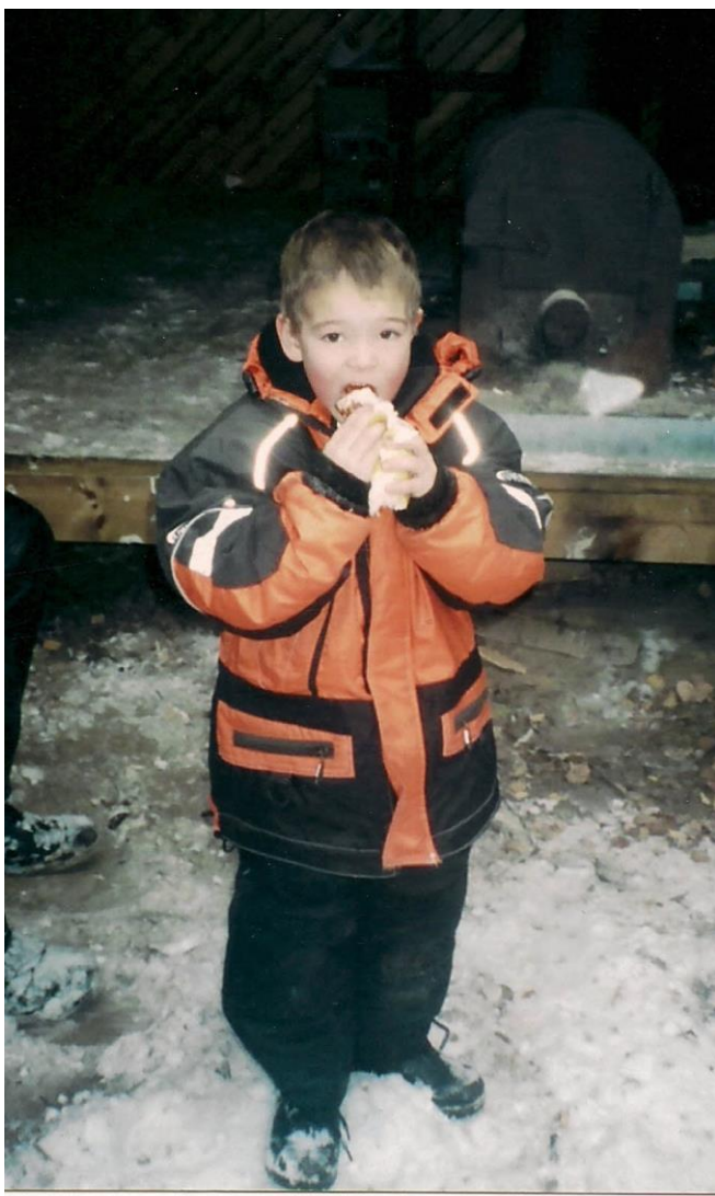
Weiner roast and ride out to the old Bay Lake Shelter at 3 1/3 years old with Dad and Mom.